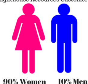
Lighthouse Resources Customers