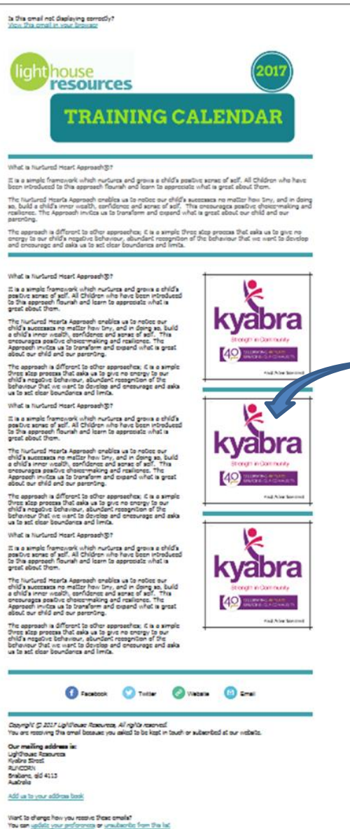
Example of an e-newsletter

Your artwork must be in jpg, jpeg or tif format and be 150 x 250 pixels. For a fee of $150 we can design the artwork for you if you are unable to supply the artwork in the required format.